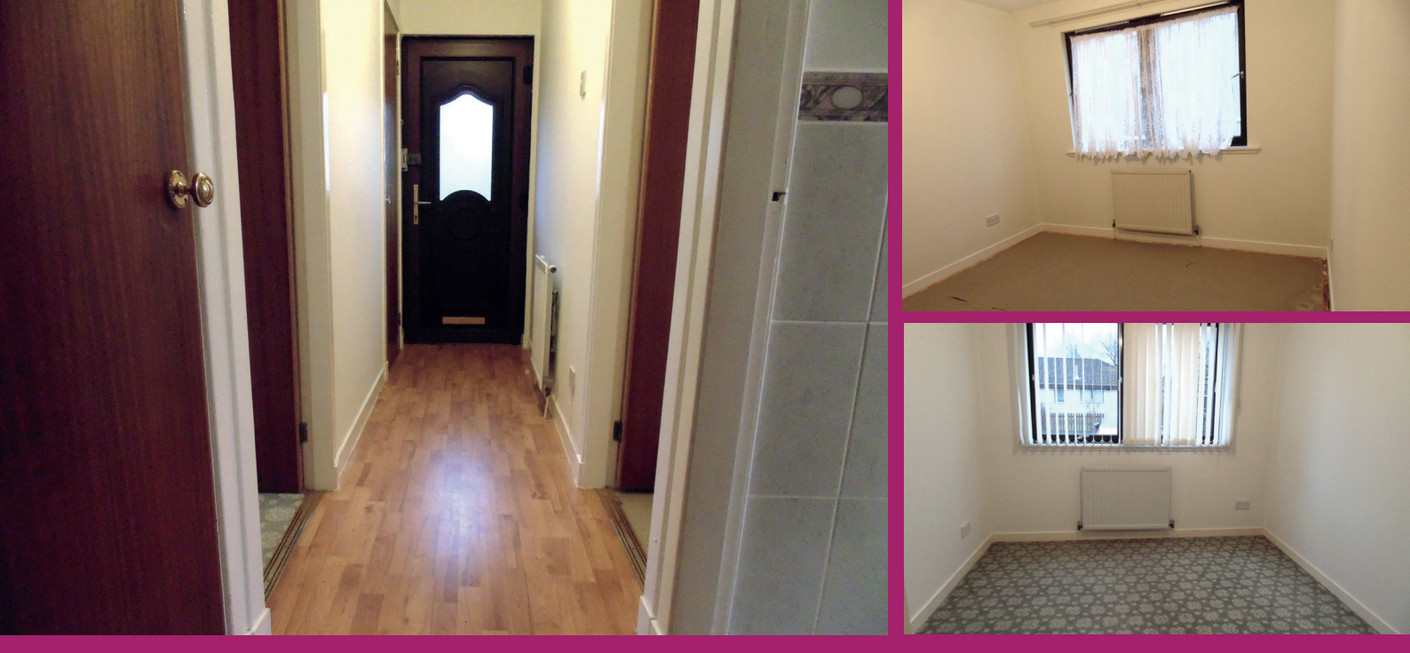
Situated within a small select development and only minutes level walking time from all the amenities and delights of Balloch. The agents GPM offer a good size 2 bedroom lower cottage flat benefiting from residents parking to the front and well kept shared gardens to the rear. Gas central heating and double glazing.

The overall accommodation comprises entrance to hallway via PVC door having glazed panel, large recess cupboards for storage. A good size lounge having double glazed window facing to the front of the property. The kitchen has a range of recently installed fitted base and wall mounted storage units, including pull out larder, in gloss white and worktops on two walls, free standing electric cooker, plumbing for washing machine and dish washer, stainless steel sink unit, natural light is gained from double glazed window facing to the rear. There 2 good size bedrooms both situated to the front and rear of the property with ample floor space for free standing furniture, recess cupboards in both bedrooms, natural light is gained from double glazed windows facing to the front. The shower room has a white wc and wash hand basin and walk in shower enclosure with electric shower.